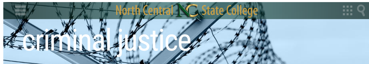
Figure 1. North Central State College's Criminal Justice Program Webpage